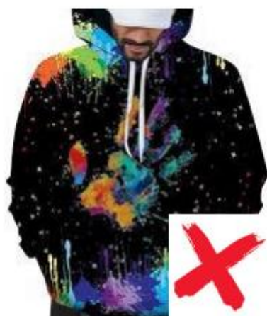
Hoodies with logos or designs are not allowed