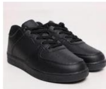
Black shoes or plain black trainers