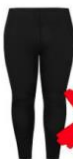
Leggings and skinny trousers are not allowed