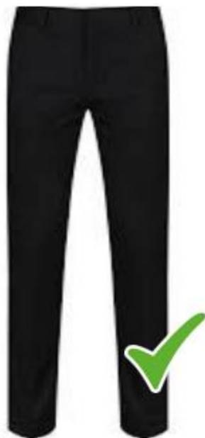
Plain black trousers