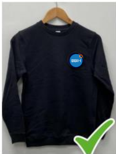
Black jumper with BBIH logo

Students will be expected to wear the compulsory black sweatshirt and black polo shirt with the new school badge affixed (see pictures). School badges can be obtained for free from the BBIH reception to be ironed on to the sweatshirts and polo shirts. Parents/carers will be able to buy the black sweatshirt and polo shirt from any shop of your choice. All students must wear the orange BBIH lanyard with either black trousers or skirt and plain black shoes or trainers. Tights and socks must be black. School badges will be posted home to all students over the summer so they can arrive in correct uniform on day one.