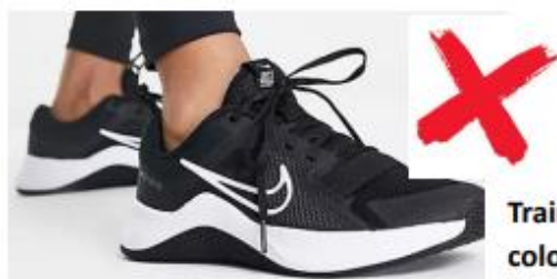
Trainers with colour or logos are not allowed

Students should have a black bag with a pencil case and equipment including: